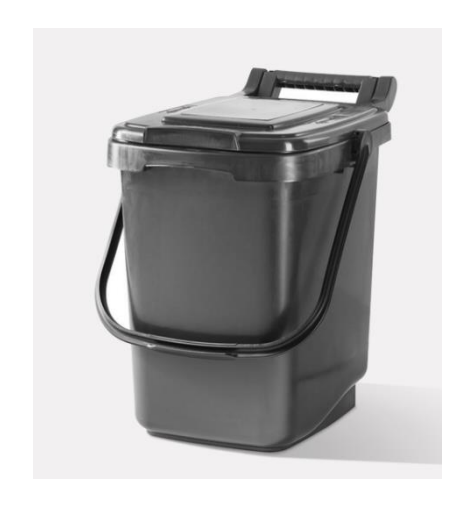
23L external caddy